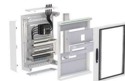
> Example of 16 modules wall mounted switchboard

1 A cable connection area with complete accessibility.