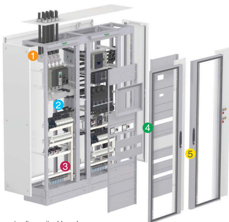
> Example of floor standing switchboard

The Prisma iPM solution perfectly integrates Schneider Electric switchgear and includes our distribution systems and enclosures. These quality components have been designed to operate together with optimised performance: mechanical, electrical and communications consistency. Switchboards designed and manufactured with the Prisma iPM solution have all the qualities needed to ensure energy availability. They are organised by function and by zone, which improves reliability and facilitates design, installation, operation and upgrading. All switchboard architectures are factory tested in line with specifications that go well beyond the IEC 61439-1 standard. The same continuity of service is ensured throughout the switchboard's entire life cycle.